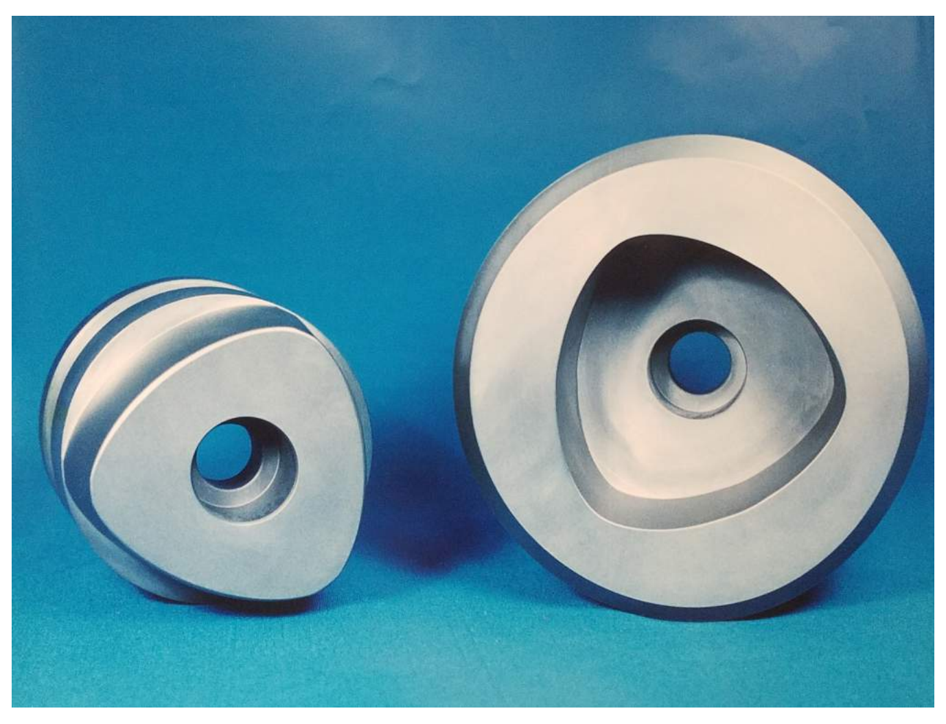
Taper Polygon; Zero Backlash; Quick Disconnect Coupling